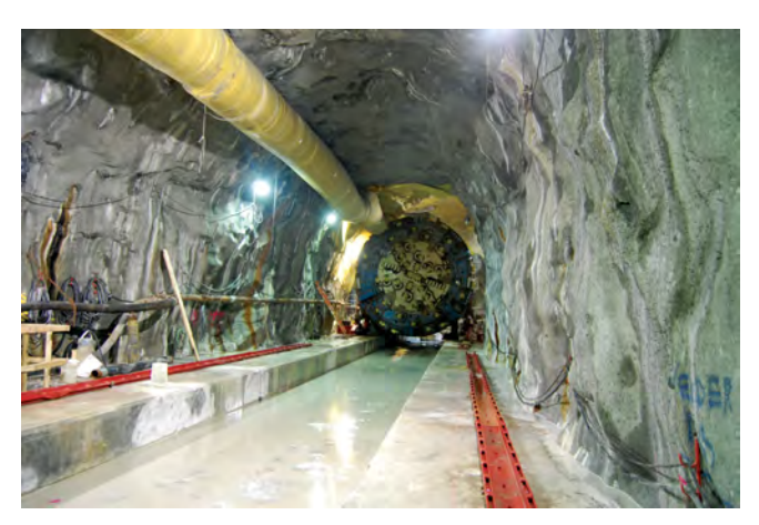
Seven years ago, construction began on the "third straw," an $817 million water intake that will allow Las Vegas to keep pace with sinking water levels in Lake Mead. The project is scheduled to go into operation this summer.