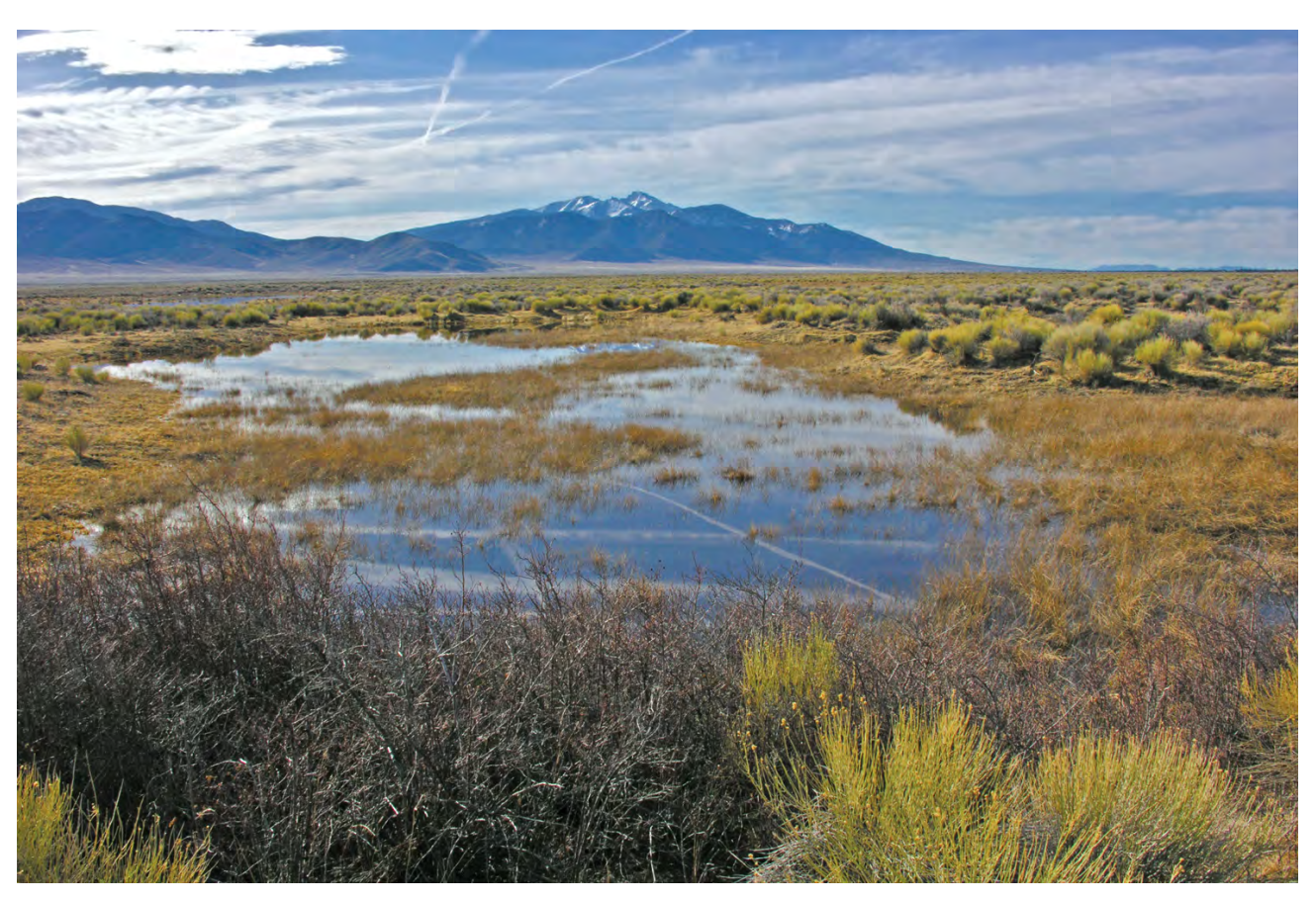
Wheeler Peak, the centerpiece of Great Basin National Park, rises from Spring Valley, near the Nevada-Utah border. The remote, sparsely populated area is a key piece of the Southern Nevada Water Authority's planned groundwater project.